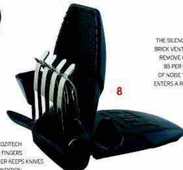
8 THE FLURI Q2TECH DIAMOND FINGERS SHARPENER KEEPS KNIVES IN TOP CONDITION.