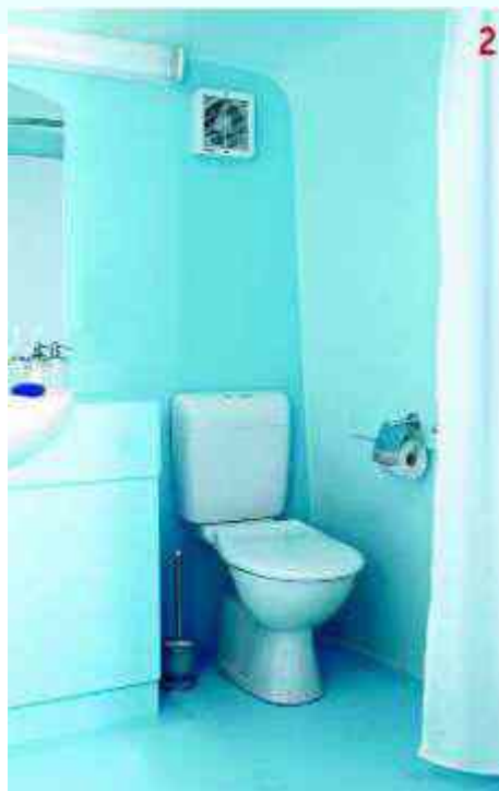
ENSUITES ON TOW IS A WELCOME RELIEF FOR PEOPLE WHO ARE RENOVATING THEIR BATHROOMS.