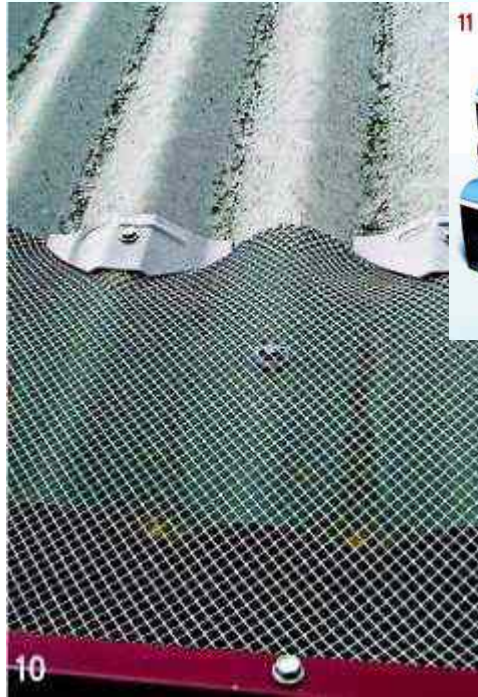
THE ULTRAGUARD ALUMINIUM GUTTER KEEPS LEAVES AND VERMIN OUT OF THE GUTTER.