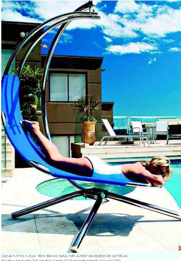
LOUNGE IN STYLE IN ZULA - ROCK, BOUNCE, SWING, TURN ALMOST 360 DEGREES OR JUST RELAX. SECURE IN THE KNOWLEDGE THE BASE IS MADE OF TOUGH MARINE-GRADE STAINLESS STEEL.