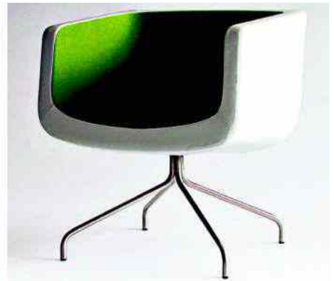
7 THE 'COMFORTABLE AND TACTILE' SMOOTH TUB CHAIR.