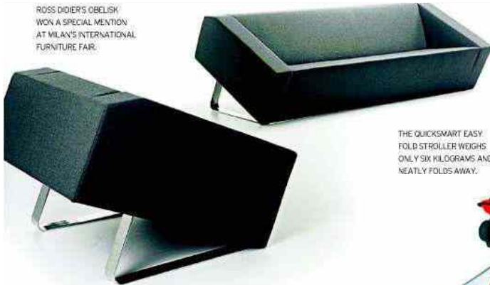
ROSS DIDIER'S OBELISK WON A SPECIAL MENTION AT MILAN'S INTERNATIONAL FURNITURE FAIR.