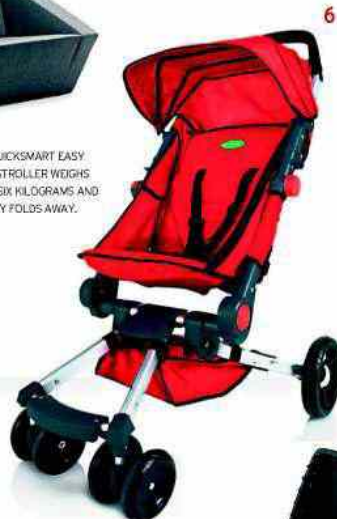
THE QUICKSMART EASY FOLD STROLLER WEIGHS ONLY SIX KILOGRAMS AND NEATLY FOLDS AWAY.