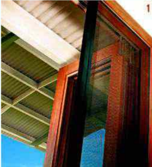
CENTOR ARCHITECTURAL SOLVES THR PROBLEM OF HOW TO ADD A SCREEN TO POPULAR BIFOLD DOORS.

For more information on all entrants, see www.designawards.com.au .