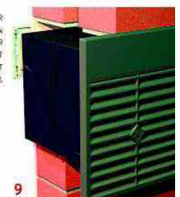
9 THE SILENCAIR BRICK VENT CAN REMOVE OVER 85 PER CENT OF NOISE THAT ENTERS A ROOM.