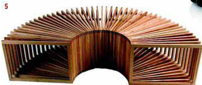
5 THE VERSATILE VERTEBRAL CAN BECOME SEATING, TABLES OR STORAGE.